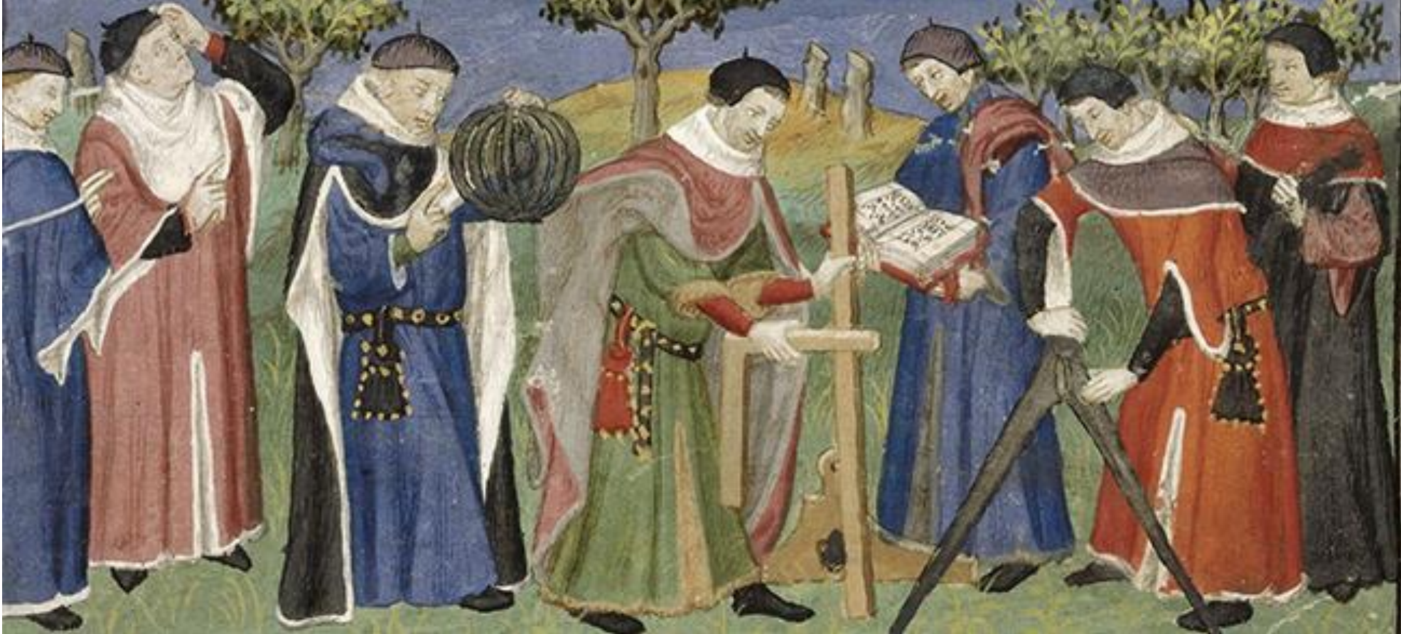
MS London, British Library, Royal 20 B. XX, f.3