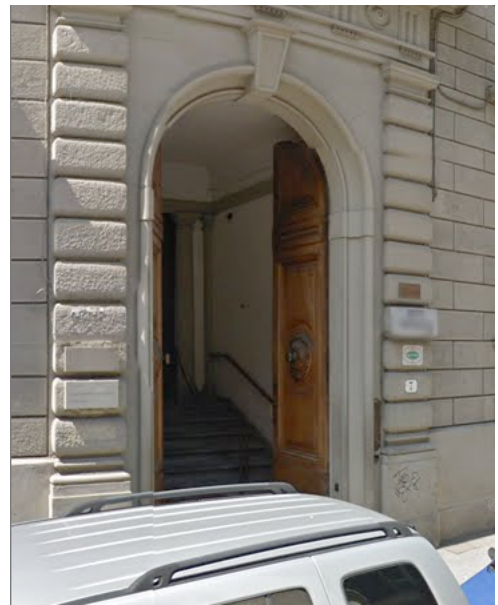
Street entrance door (PMD: II floor)